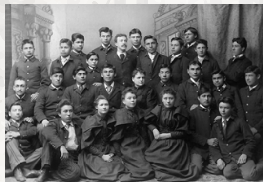
Carlisle Industrial School students